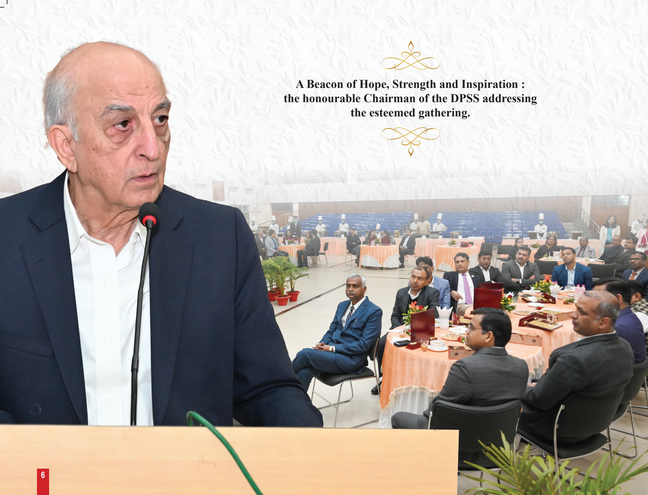
A Beacon of Hope, Strength and Inspiration : the honourable Chairman of the DPSS addressing the esteemed gathering.