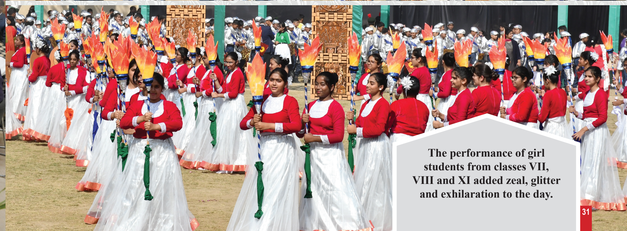
The performance of girl students from classes VII, VIII and XI added zeal, glitter and exhilaration to the day.