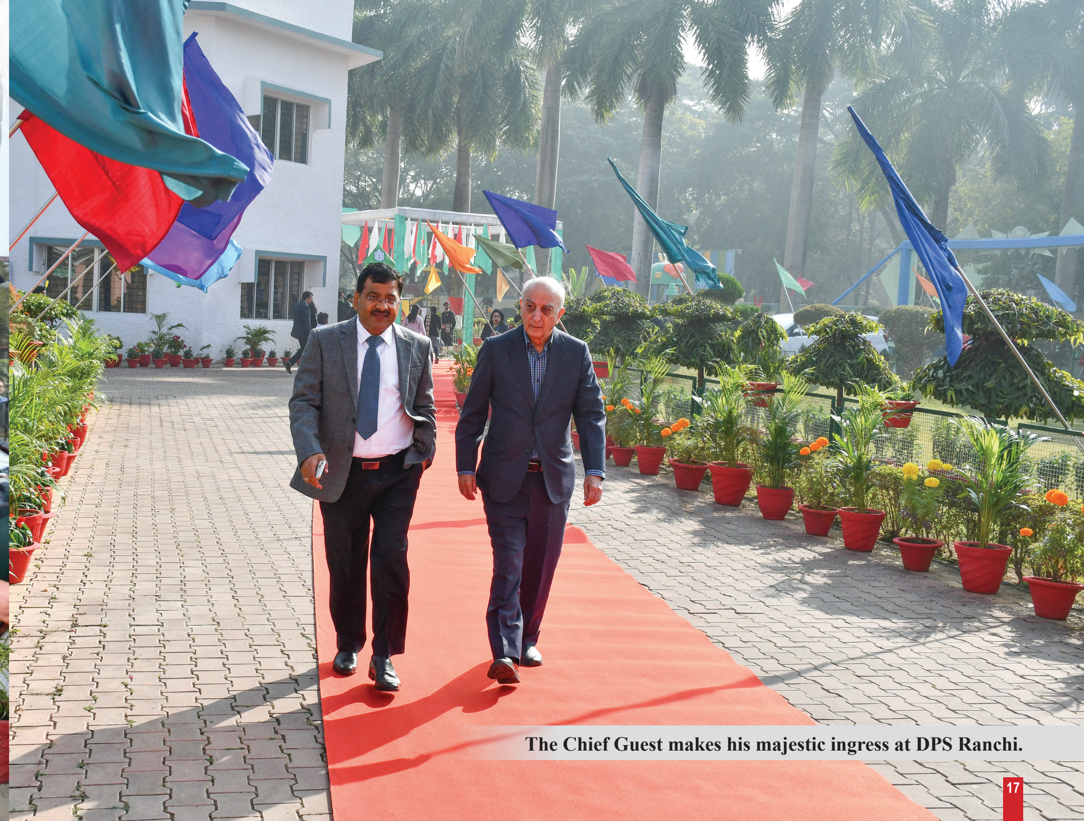
The Chief Guest makes his majestic ingress at DPS Ranchi.