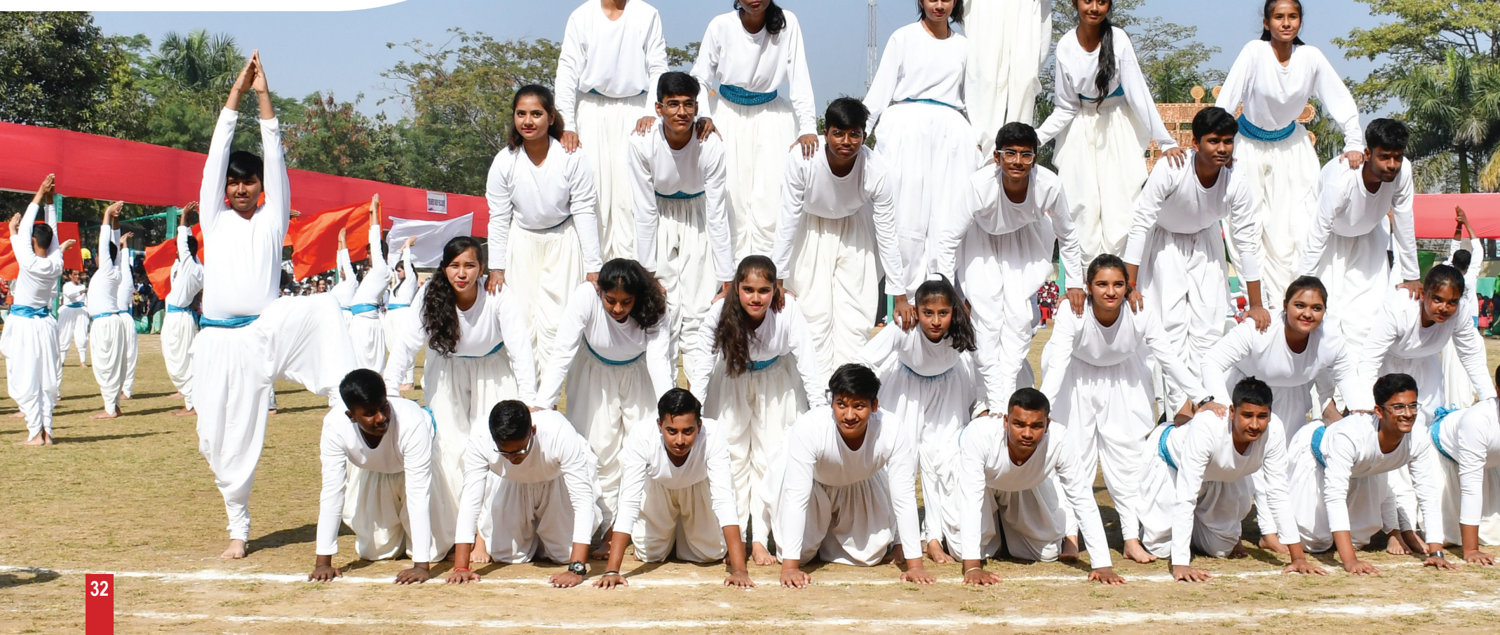
The dynamic and indefatigable students of Class IX showcasing a scintillating, spectacular yet soothing Yoga display, all in whites.