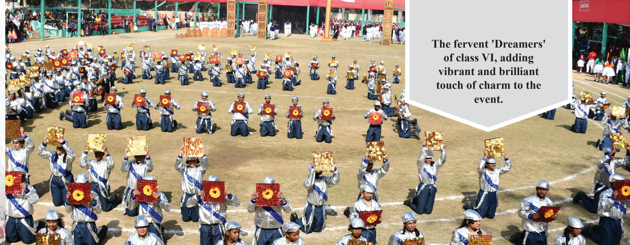
The fervent 'Dreamers' of class VI, adding vibrant and brilliant touch of charm to the event.