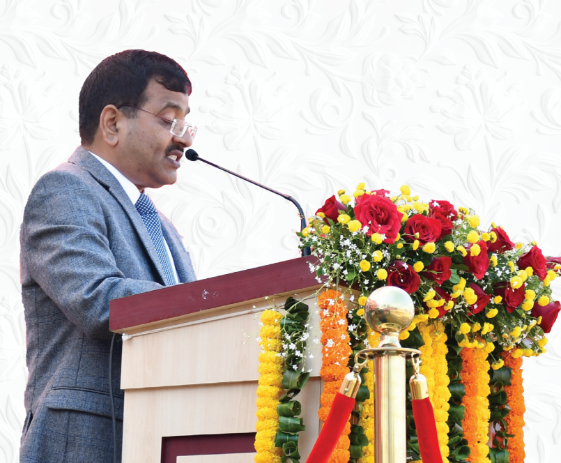
The Principal DPS Ranchi addressing the august assemblage of guests and cohort of students brimming with energy and enthusiasm.