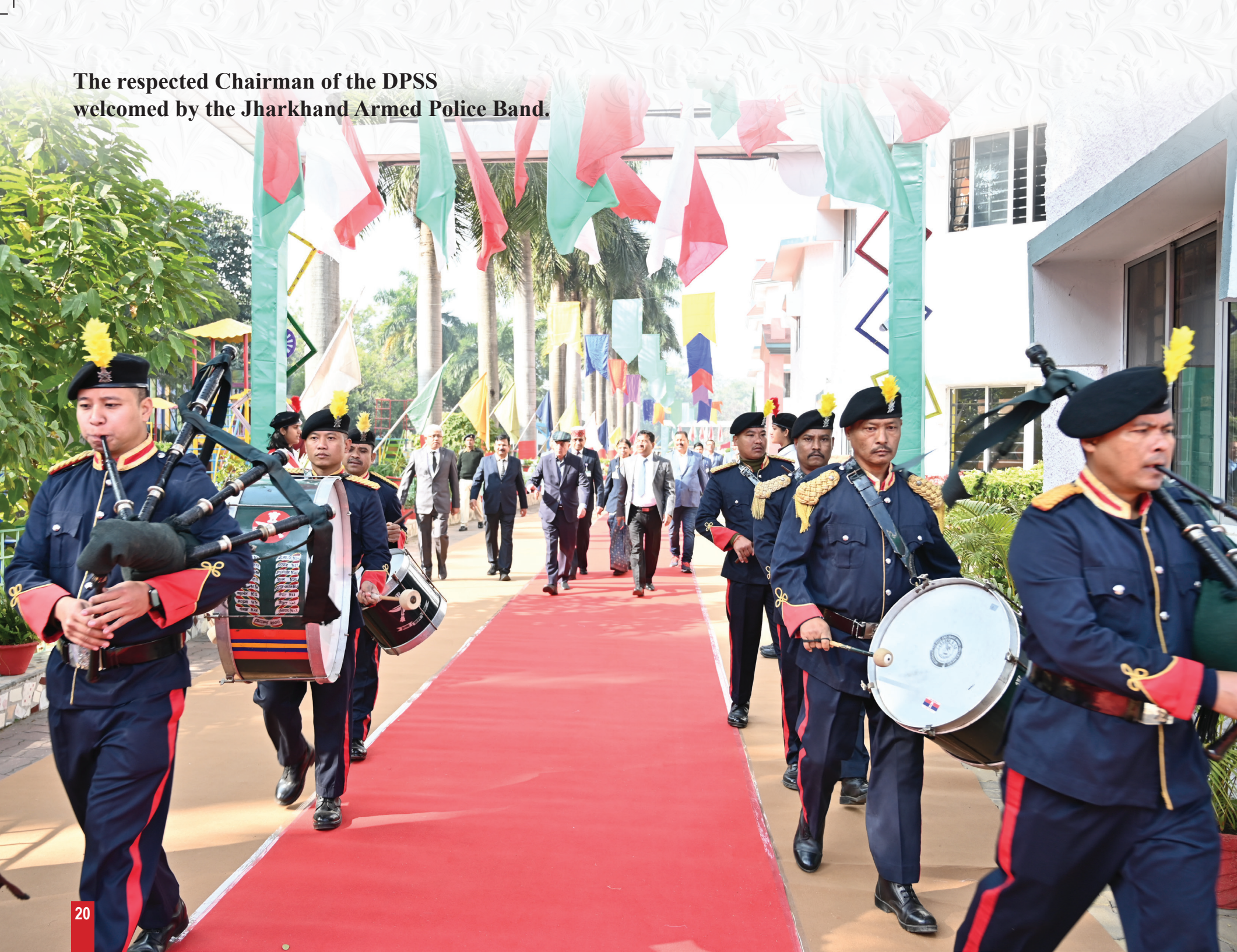
The respected Chairman of the DPSS welcomed by the Jharkhand Armed Police Band.