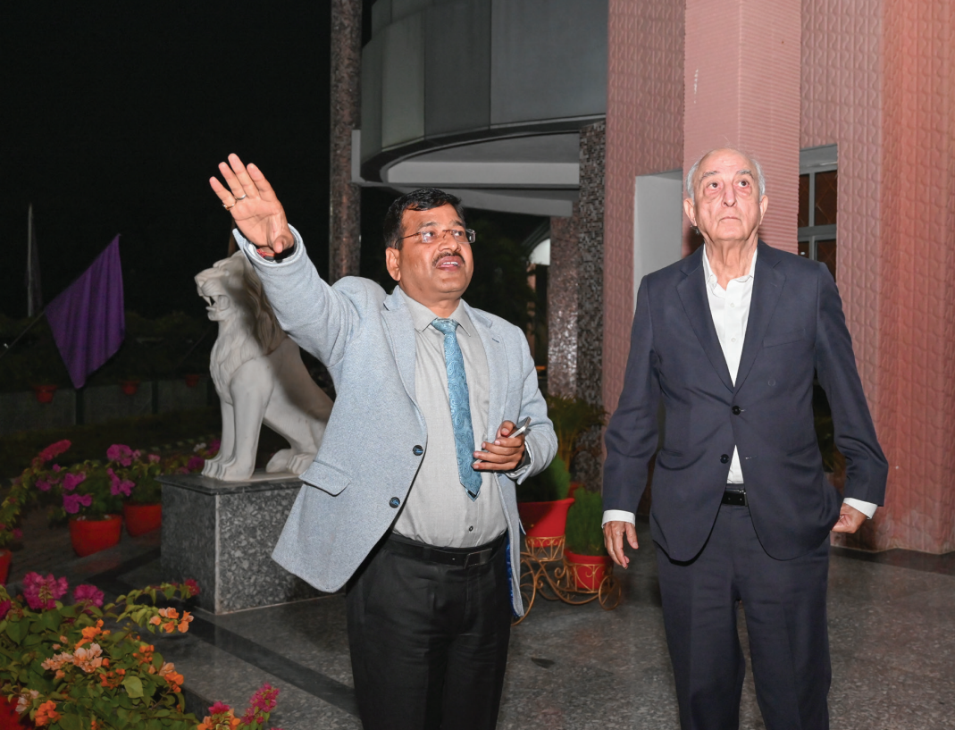
The distinguished Chairman having a coup d'œil of the school with the Principal.