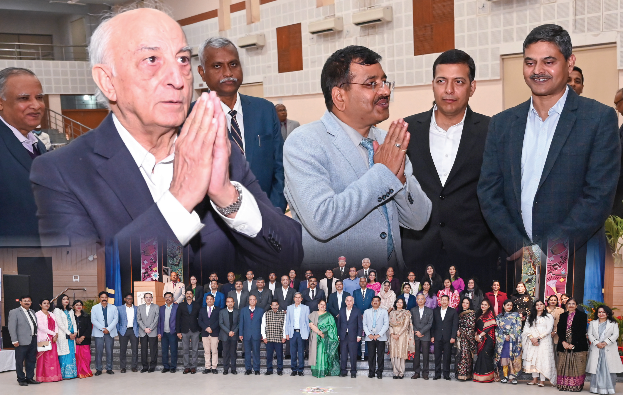
A constellation of visionary and industrious administrators at the culmination of the programme.