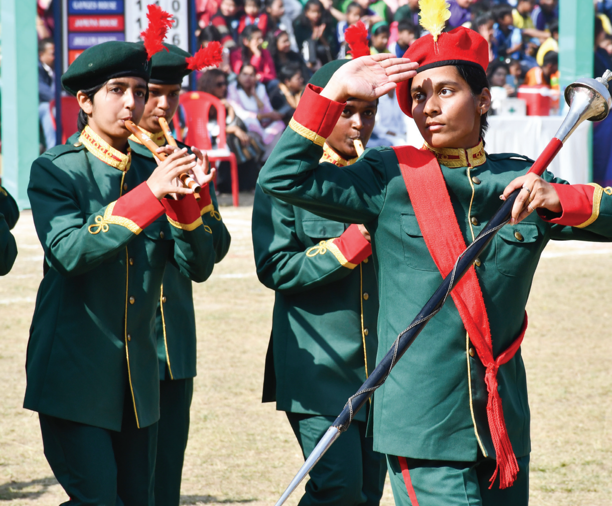
The School Band of DPS Ranchi pays its utmost tribute to the iconic Chief Guest.